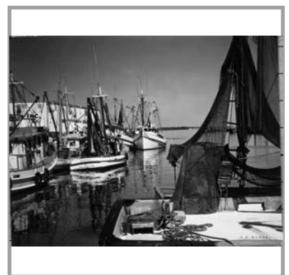
Part of the "Italian Fleet" of shrimp boats tied up at Pier 9, Galveston, October 6, 1954