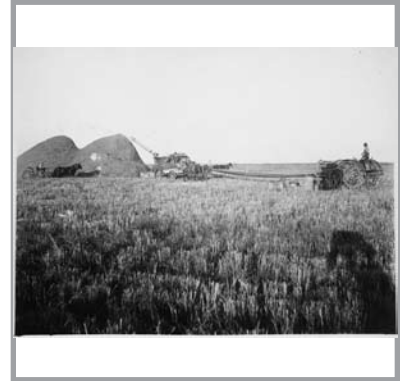
Dutch descendants harvesting grain crops in the Winnie-Hamshire area