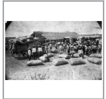
Tejano sheep-shearing crew with bags of wool bound for Galveston, Cotulla, c. 1890