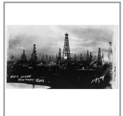
Night scene of oil derricks in Wortham during the 1920s