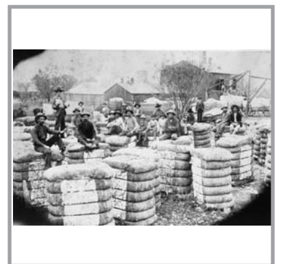
Cotton gin at Yancey, c. 1914