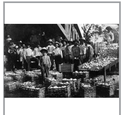
Onion harvest, Cotulla, early 1900s