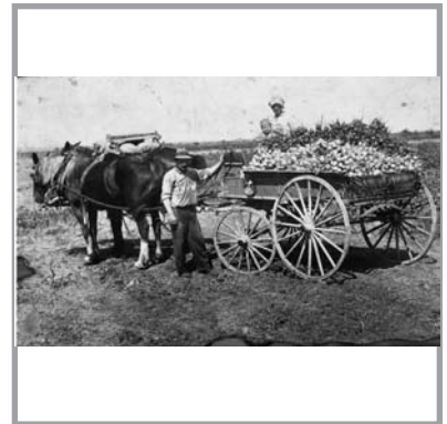
Belgian Texans Peet and Mary Persyn on the way to market, Bexar County, 1917

Both blessed and challenged with amazing resources, Texas is certainly a land of plenty—although sometimes that includes plenty of water, wind, heat, and cold. Texans' relationships with the land and the waters of the state have been a study in contrasts as we celebrated great harvests and then watched the topsoil blow away with dustbowl winds; cursed drought and struggled through hurricanes; punched dry holes and gushers; and fought everything from screwworms to fire ants. Taking the good with the bad, Texans keep rising to the next challenge.