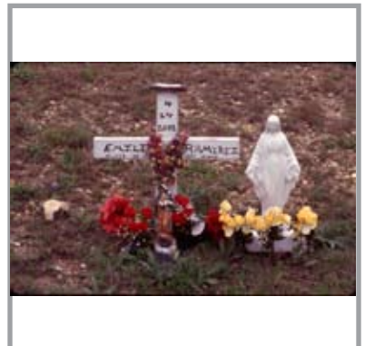
Descanso erected for Emilio Ramirez near Zorn, 2003