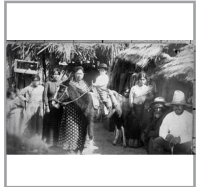
Vaqueros and family near Cotulla, c. 1890