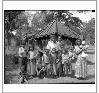
Russian gypsies camping in Covington Park, San Antonio, 1934