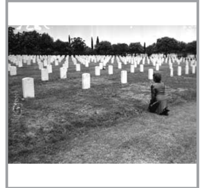
Fort Sam Houston National Cemetery, May 31, 1948