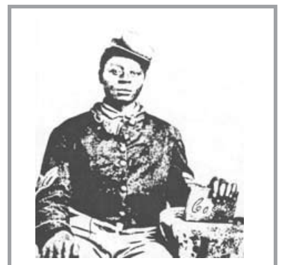
Buffalo Soldier of the 24th Infantry Regiment