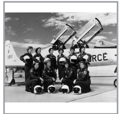
First women trained as Air Force combat pilots. Lackland AFB, San Antonio, 1977