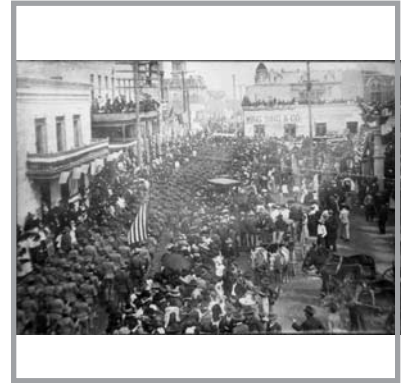
U.S. Army troops leaving for the Spanish-American War, Laredo, 1898

The peoples of Texas have fought with each other and against the world when called. At times fighting for glory, for territory, for independence, or for their very lives, Texans of all backgrounds have distinguished themselves with their sacrifices.