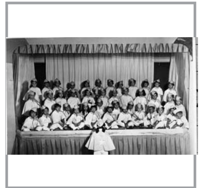
Chorus of Japanese and German elementary school children, Crystal City internment camp, 1945