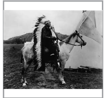
Quannah Parker, Comanche chief